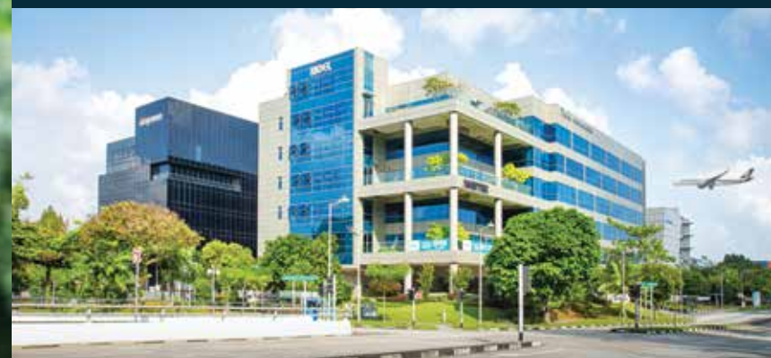
CHANGI BUSINESS PARK