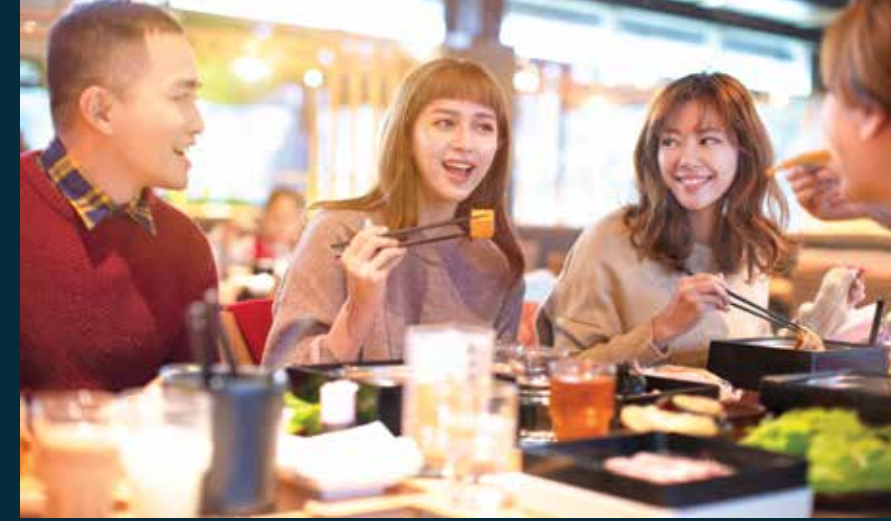
VIBRANT DINING AND SHOPPING OPTIONS

Open roads and meandering footpaths whisk me to plush greenery, family-friendly hangouts, and dynamic community hubs that speak to my lifestyle and passion for elating exploration.