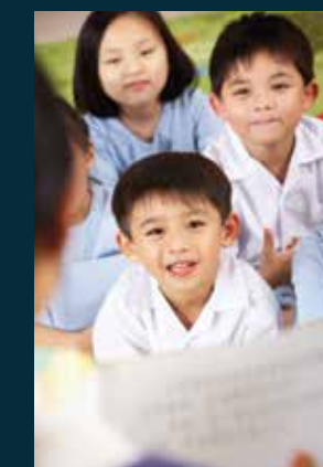
PASIR RIS PRIMARY SCHOOL