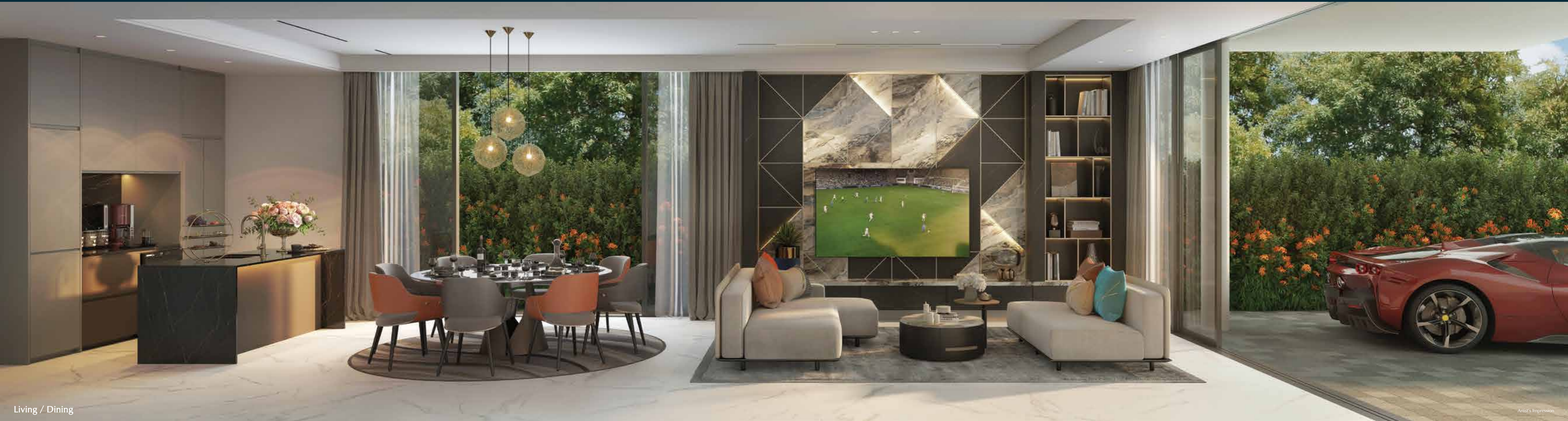
Living / Dining