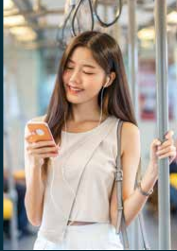
LOYANG MRT AND PASIR RIS EAST MRT STATIONS (U/C)

At the centre of connectivity lies the potential for boundless discovery. The future Loyang and Pasir Ris East MRT stations unlock smoother accessibility for me to venture throughout Singapore with unparalleled ease.