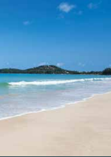
CHANGI BEACH PARK ENHANCEMENT

Along sun-dipped shores will be newly developed landscaping and amenities that radiate a sense of community and leisure such as picnic spots, a lively waterfront area, and expanded walking and cycling paths that include a 15km green corridor that connects to East Coast Park.