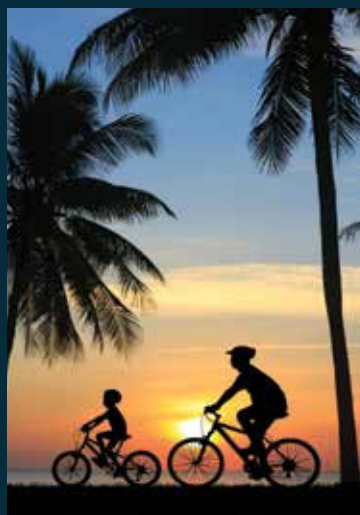
ROUND ISLAND ROUTE AND CYCLING NETWORK

Landscaped for nature enthusiasts and active lifestyles, extensive park connectors and scenic trails that stretch across Changi Bay will link to more future nodes that loop around Singapore, offering delightful discoveries and vibrant views to experience and admire in every step and turn.