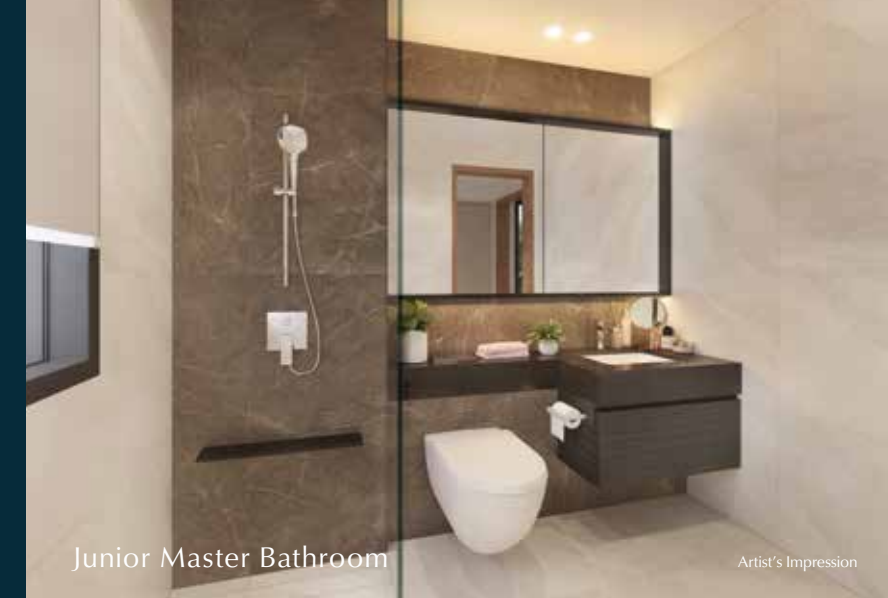
Junior Master Bathroom