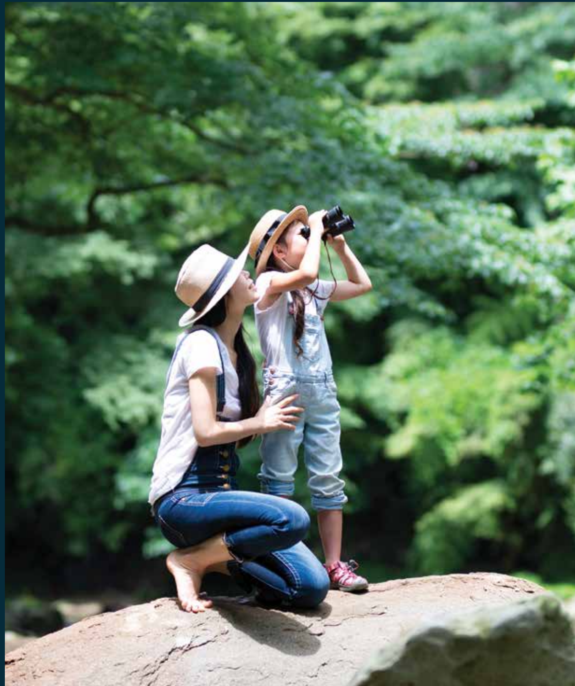
TRANQUIL PARK AND LEISURE RECREATION

Open roads and meandering footpaths whisk me to plush greenery, family-friendly hangouts, and dynamic community hubs that speak to my lifestyle and passion for elating exploration.