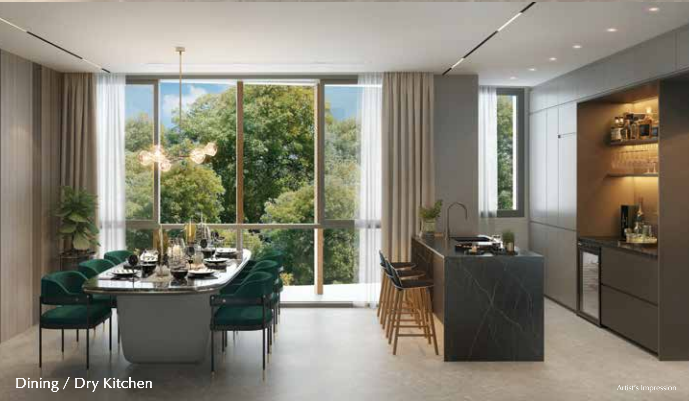
Dining / Dry Kitchen