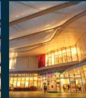
CHANGI CITY POINT