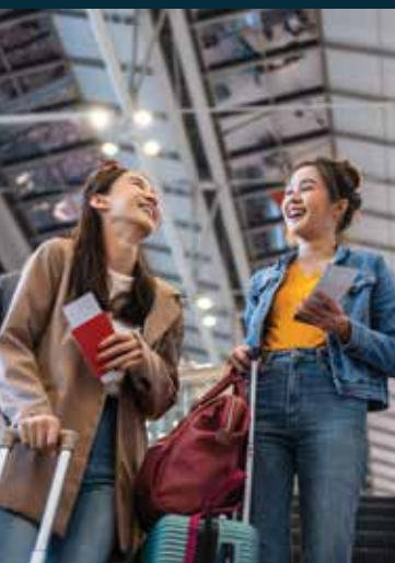
CHANGI AIRPORT TERMINAL 5

An upcoming globetrotter haven, Terminal 5 is set to be the grandest terminal that will redefine the prestige of Changi Airport, envisioned to handle up to 50 million passengers per year. Here awaits an onset of technological advancements and deluge of facilities for every local and discerning traveller.